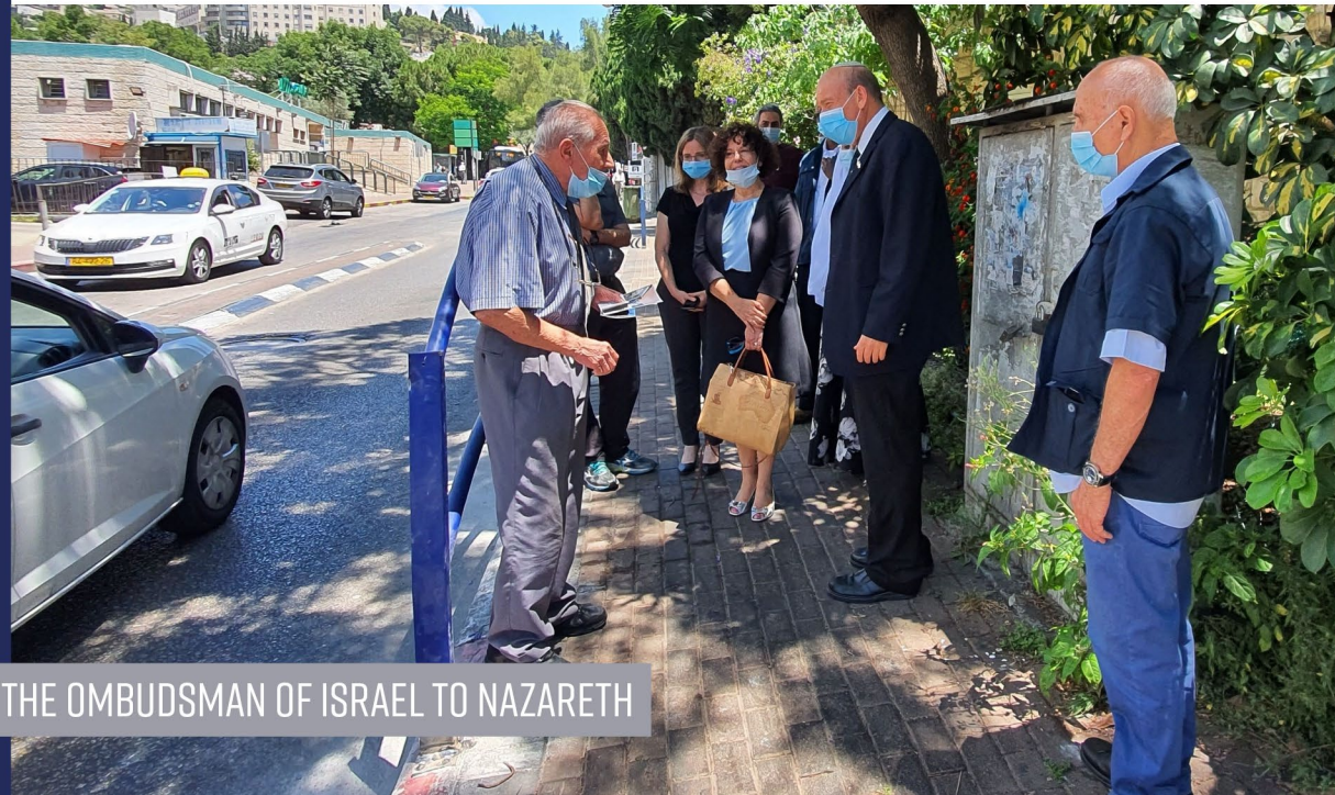
VISIT OF THE OMBUDSMAN OF ISRAEL TO NAZARETH